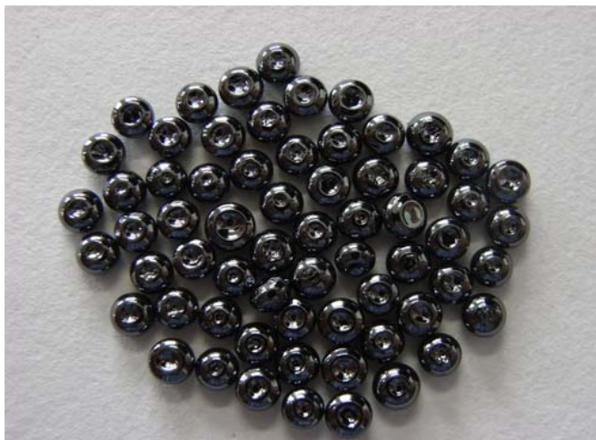
Selenium granule photo

* Standard packaging: in 25kg-pail (with purged inner PE bag)