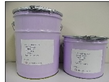
Left : 20-liter pail