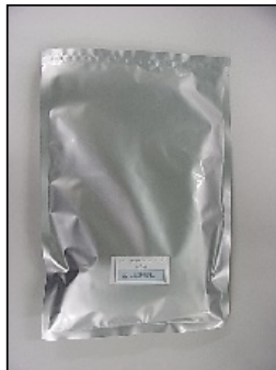
Inner Al bag purged with N2 gas

* Standard packaging: 25kgs Selenium granules in a 20-liter pail (Inner Al bag packaging shall be an option).